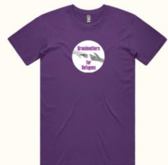
Grandmothers For Refugees Tee $40

Visit our website today www.grandmothersforrefugees.org