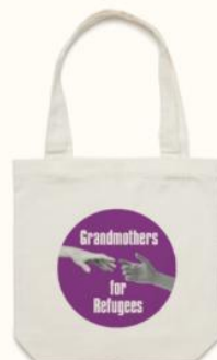
Grandmothers For Refugees Tote $25

Grandmothers for Refugees advocates for compassionate welcome and safe settlement of all people seeking asylum. For every tee purchased, Das T-Shirt Automat will donate $18 to Grandmothers for Refugees and $9 for every tote.