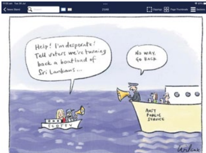
Cathy Wilcox, The Age, 26 July 2022

If the Government is to be motivated to do more than is in Labor's policy platform "bible", it will only be when individual MPs argue for it in the party room due to the constant pressure they are under from their own constituents. This helps set the strategic direction for Grandmothers for Refugees.