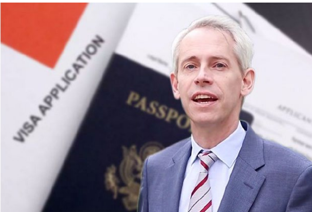
Immigration Minister Andrew Giles has a backlog of asylum applications to deal with, with more incoming

After ten years or more, there are still people indefinitely held in immigration detention. The new Immigration Minister, Andrew Giles, is understood to be reviewing these cases.