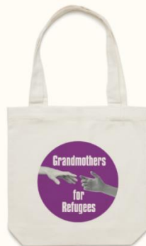
Grandmothers For Refugees Tote $25

Grandmothers for Refugees advocates for compassionate welcome and safe settlement of all people seeking asylum. For every tee purchased, Das T-Shirt Automat will donate $18 to Grandmothers for Refugees and $9 for every tote.