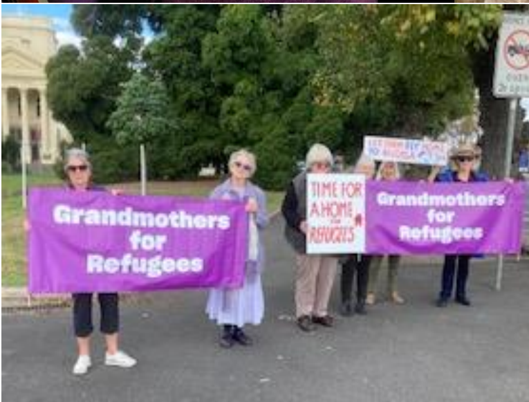
Macnamara Grans keep up the #timeforahome campaign message in their community.