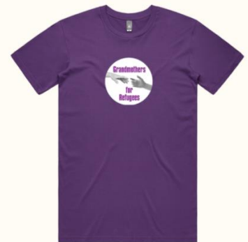
Grandmothers For Refugees Tee $40