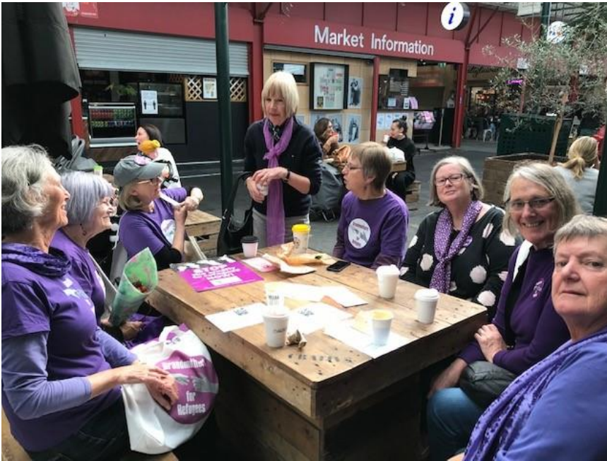
Cooper Grandmothers out and about making their (purple) presence obvious.