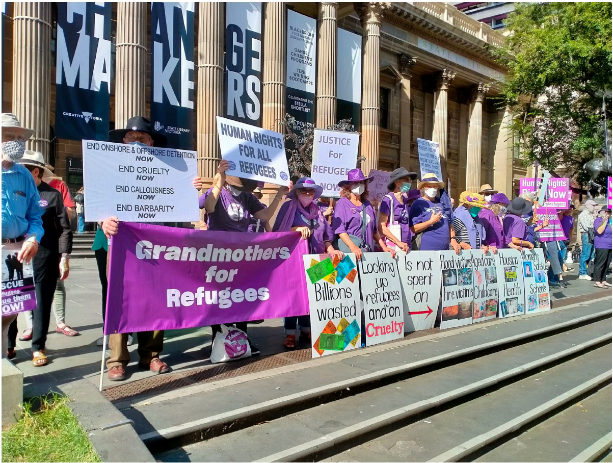
Rallying for change, justice and freedom for refugees Palm Sunday, Melbourne, 2022