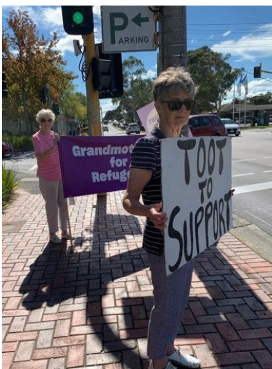
Counting the toots for refugees and honks for humanity are part of gathering feedback at street vigils.