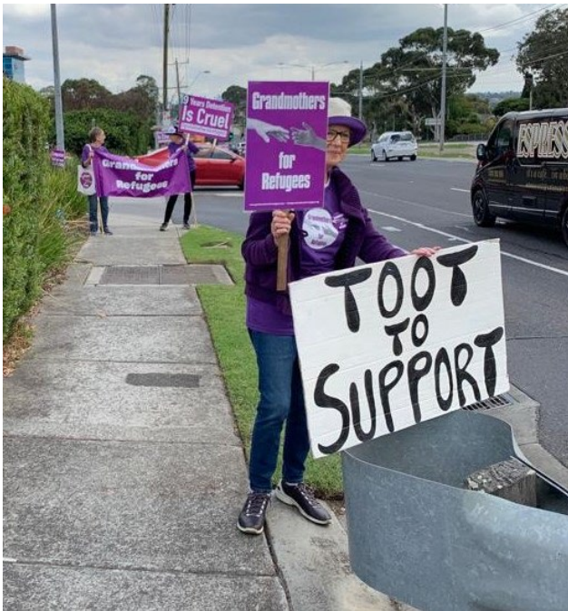
Neither rain nor reputation deter Grandmothers for Refugees from keeping up their vigil commitments in Chisholm, Casey and Kooyong.